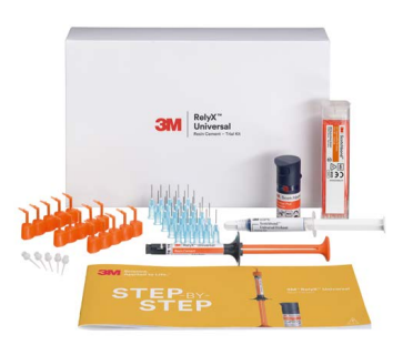
3M™ RelyX™ Universal Resin Cement Trial Kit TR (56969)