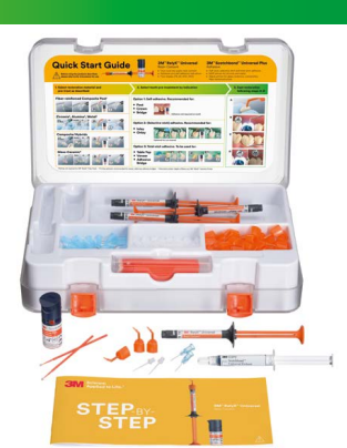
3M™ RelyX™ Universal Resin Cement Intro Kit (56968)

41263 2 x 3M™ Scotchbond™ Universal Etchant (3 ml each), 50 dispensing tips