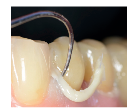
Self-adhesive cementation of a 3M™ Lava™ Esthetic Fluorescen Full-Contour Zirconia bridge

Efficient to the last step. Its unique chemistry ensures excess outflow stays put at the restoration margins, and can be easily removed after tack curing.